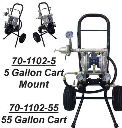
70-1102-5 5 Gallon Cart Mount