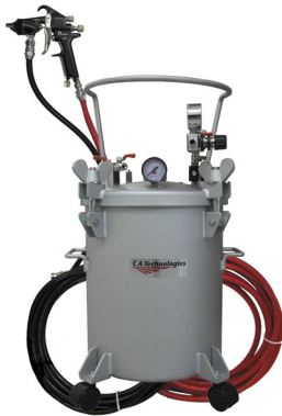
OP100G-504 5 Gallon Tank Outfit