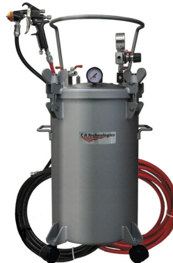
OP100G-882 12.5 Gallon SS Tank Outfit