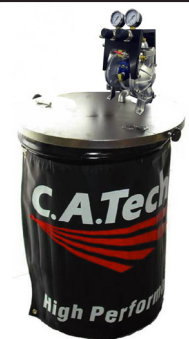
70-1105 55 Gallon Drum Mount