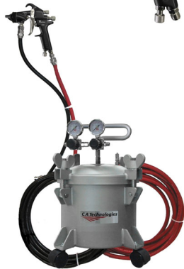
OP100G-202 2.5 Gallon Tank Outfit