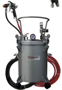
OP100G-852 5 Gallon SS Tank Outfit

C.A. Technologies double diaphragm pumps are the answer for spraying virtually any type of adhesives, including "sheer sensitive" products. They're perfect for single, multi-hand gun and automatic spray systems. Available with optional fluid regulator (52-203) to provide pulse free operation and multi-gun setups. Stainless steel construction, teflon diaphragms and stainless steel balls and seats, these units are rated at 12 gallons per minute at maximum of 100 psi fluid pressure.